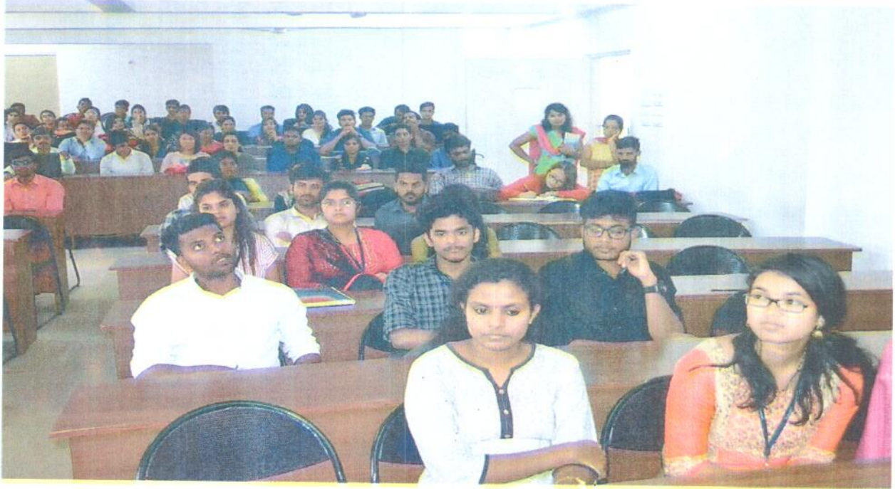
Student participation in the seminar