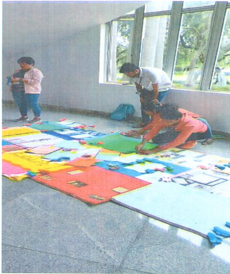
Wall Magazine Prepared by the student