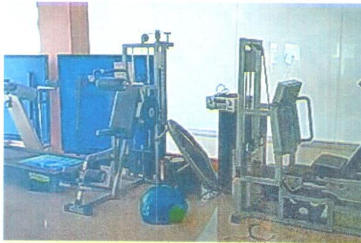
Student Workout in the GYM