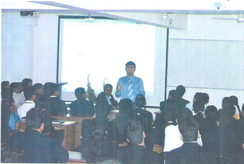
Resource Person in the session