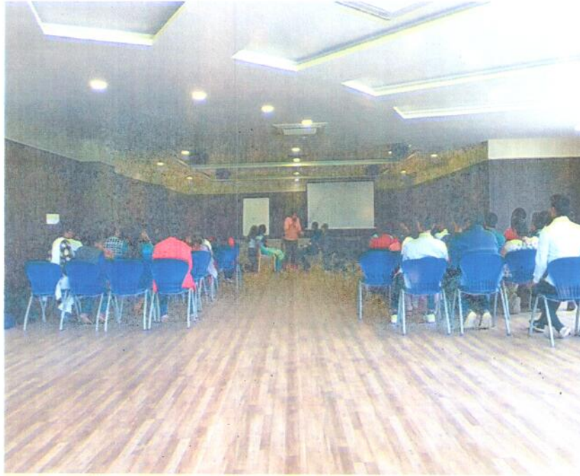
Interactive Session with students and Resource Person