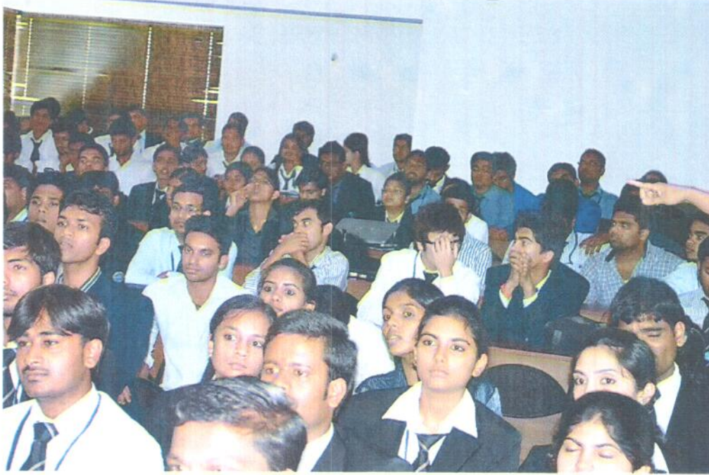
Students in the Seminar