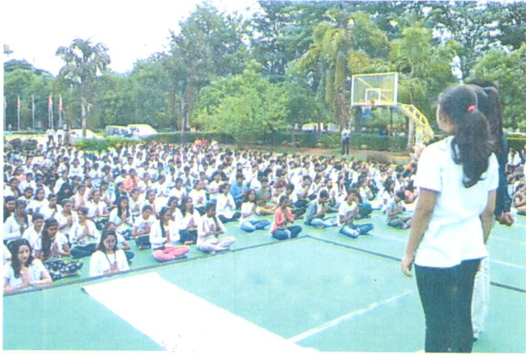
Instructor with students in the session