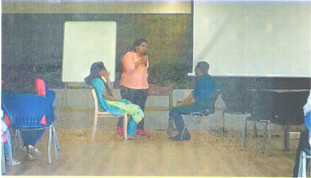
Student Participating in the activity in the program